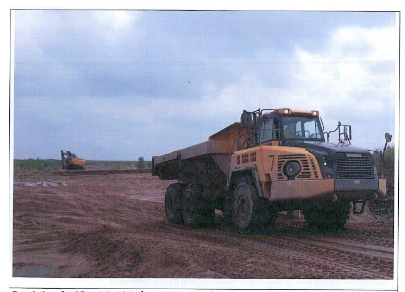
Description: Sand Excavation Area from Former Manufacturing Area (Facing East) Location: Johns Manville Site, Waukegan, IL Date: August 19, 2014

Perimeter air monitoring results have not detected asbestos. The National Pollutant Discharge Elimination System (NPDES) tests for discharge to Lake Michigan are ongoing and asbestos has not been detected to date.